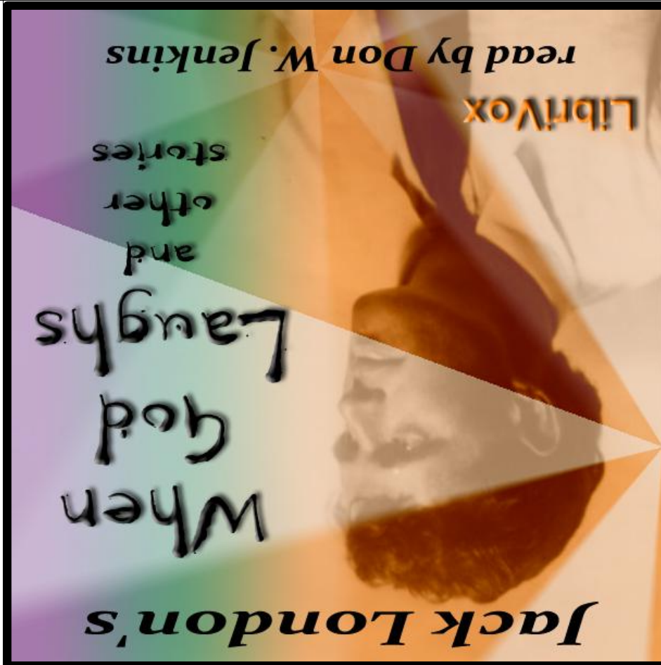
Cover image: Jack London in 1900 Cover design for Librivox by Michele Fry

Easy Folding Instructions for this Origami CD case, including step by step photos, can be found here . Can also access from the LV Wiki page, CD Covers.